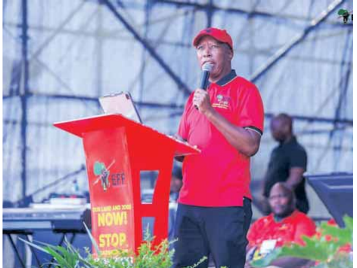
UJulius Malema ethetha eBuffalo City Stadium, eMonti.

"Kodwa lo nto ayithi umntu uya kubhubha elihlwempu. Umntu uyakwazi ukuyiguqula imeko yekhaya ibengcono. Kodwa ke xa sisithi yenzani abantwana, asibhekisi ebantwaneni. Bona mabaye esikolweni bayokufunda simahla," utshilo uMalema.