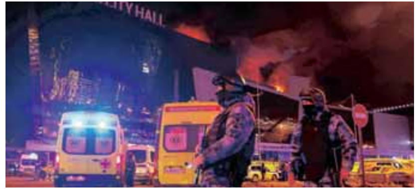
Amagosa omthetho ngaphandle kwendawo yolonwabo iCrocus City Hall ebisitsha ngoLwesihlanu weveki ephelileyo.