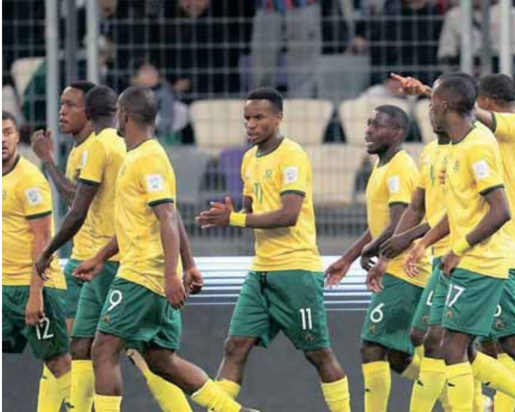
Iqela lebhola ekhatywayo iBafan Bafana