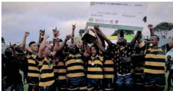
Iintshatsheli zeSuper 14 ezivunyiweyo yiEast London Police.

"Khumbula ukuba siye emdlalweni wokugqibela siziintshatsheli ezikhuselayo. Besizimisele ukuphumelela nokuba kungenqaku elinye. Sinabadlali abatsha abaziqambisileyo namhlanje ukuba bayawudlala umbhoxo. Andinamazwi emva kwempumelelo yethu," utshilo uMkaza emva komdlalo.